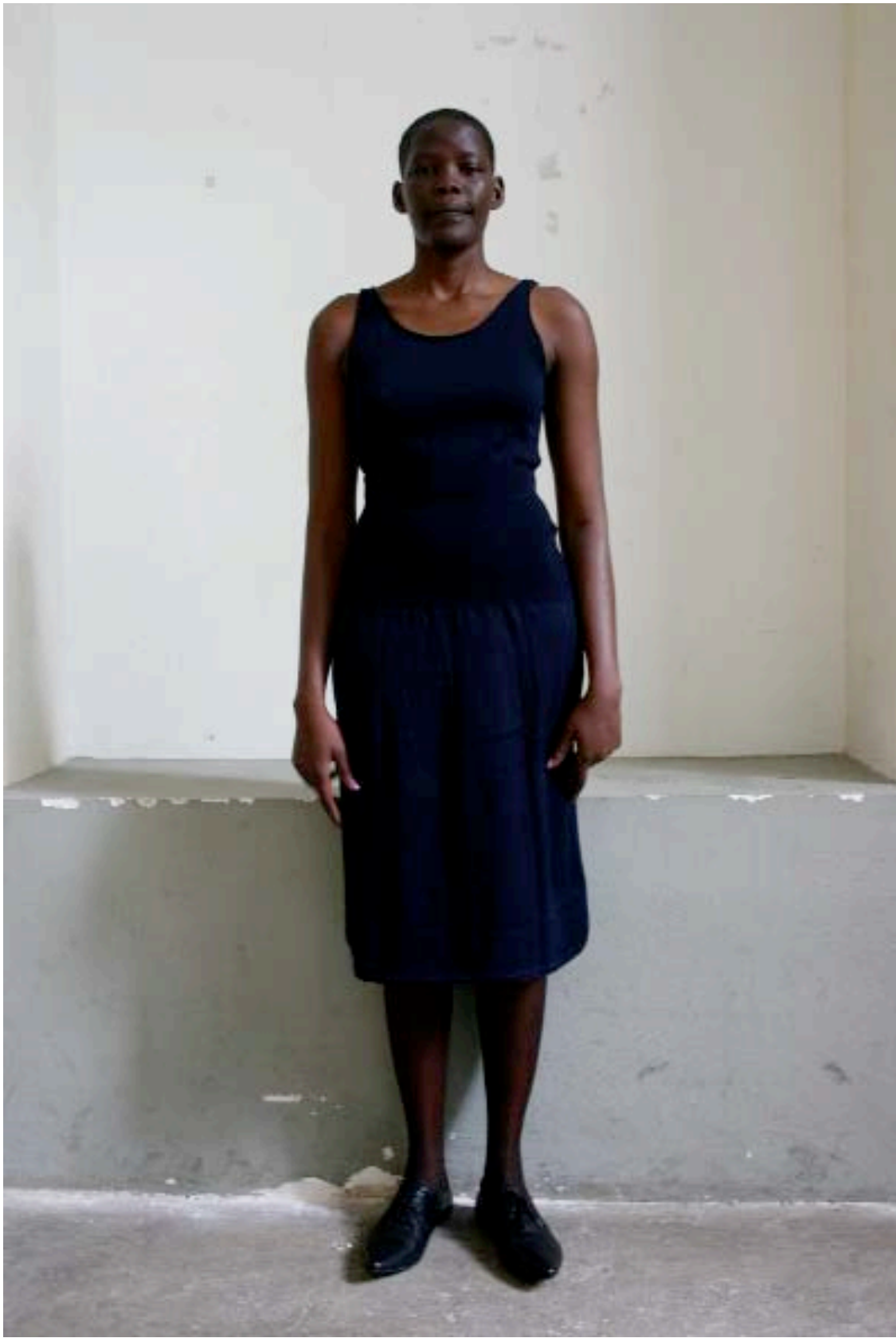
dress; NR 14 100% fine merino wool colours; black, blue