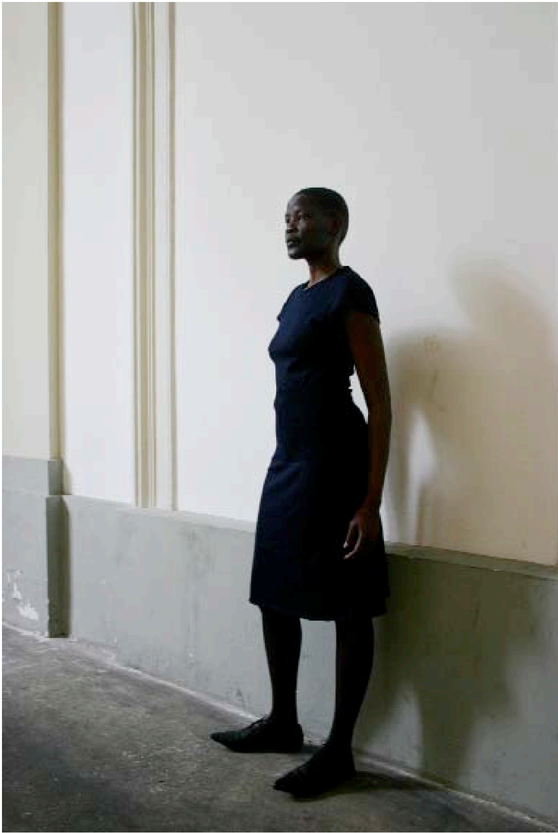
dress; NR 16 100% fine merino wool colours; blue