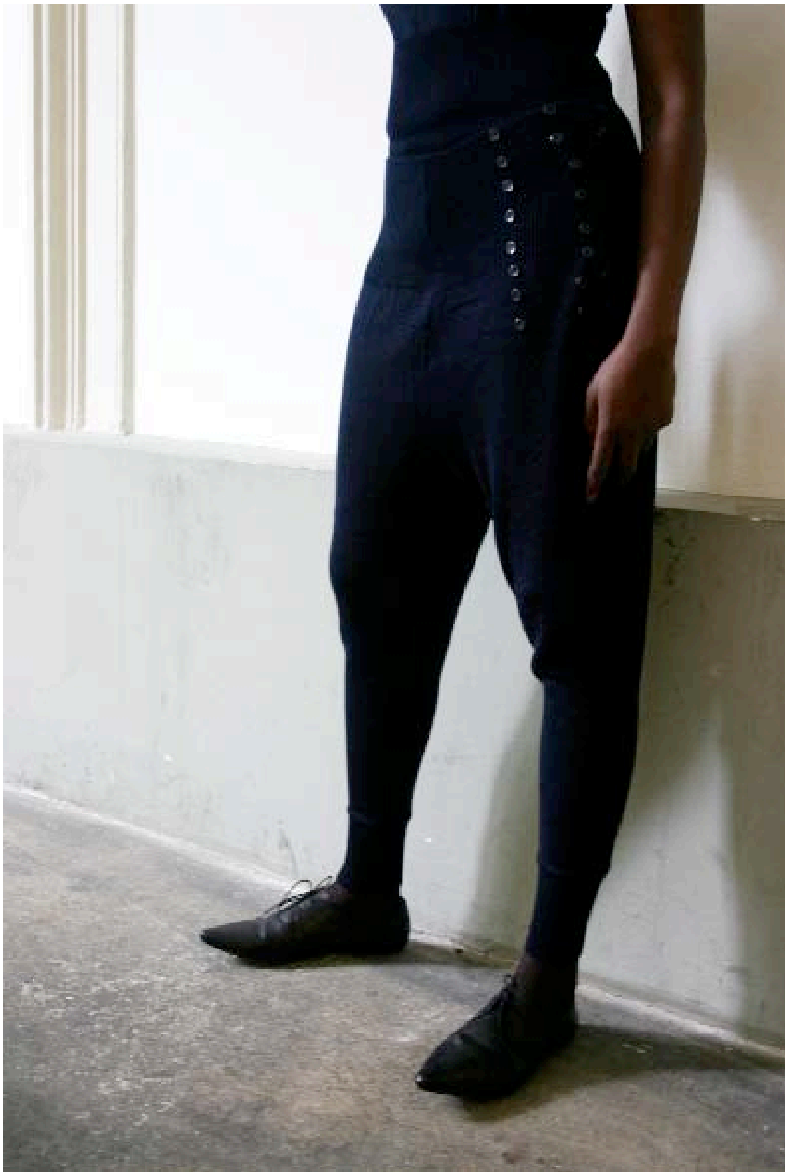
pants; NR 11 100% fine merino wool colours; black, blue