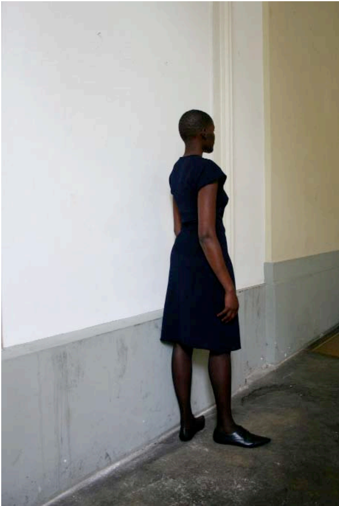
dress; NR 16 100% fine merino wool colours; blue