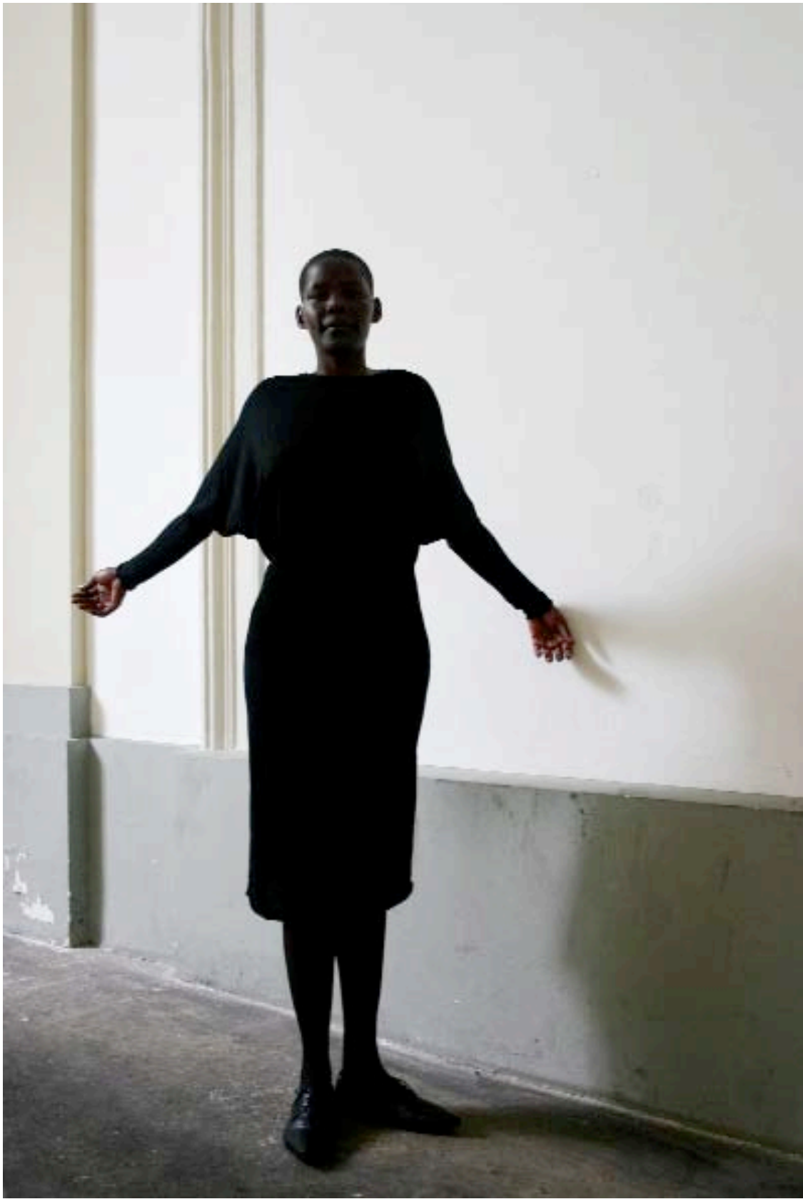
dress; NR 15 100% fine merino wool colours; black